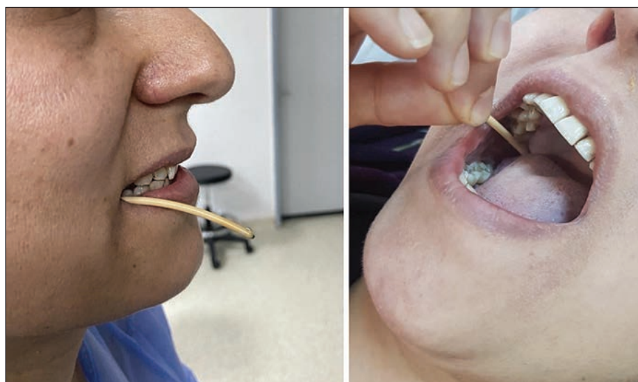
Fig. 1. The distal end of the catheter is seen exiting the mouth.

Obr. 1. Je vidět distální konec katetru vycházející z úst.