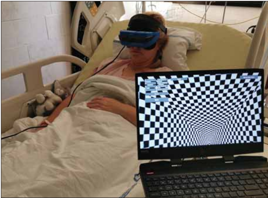
Fig. 3. Virtual reality in vestibular rehabilitation in patient after vestibular schwannoma surgery.

Obr. 3. Použití virtuální reality při vestibulární rehabilitaci u pacienta po operaci vestibulárního schwannomu.