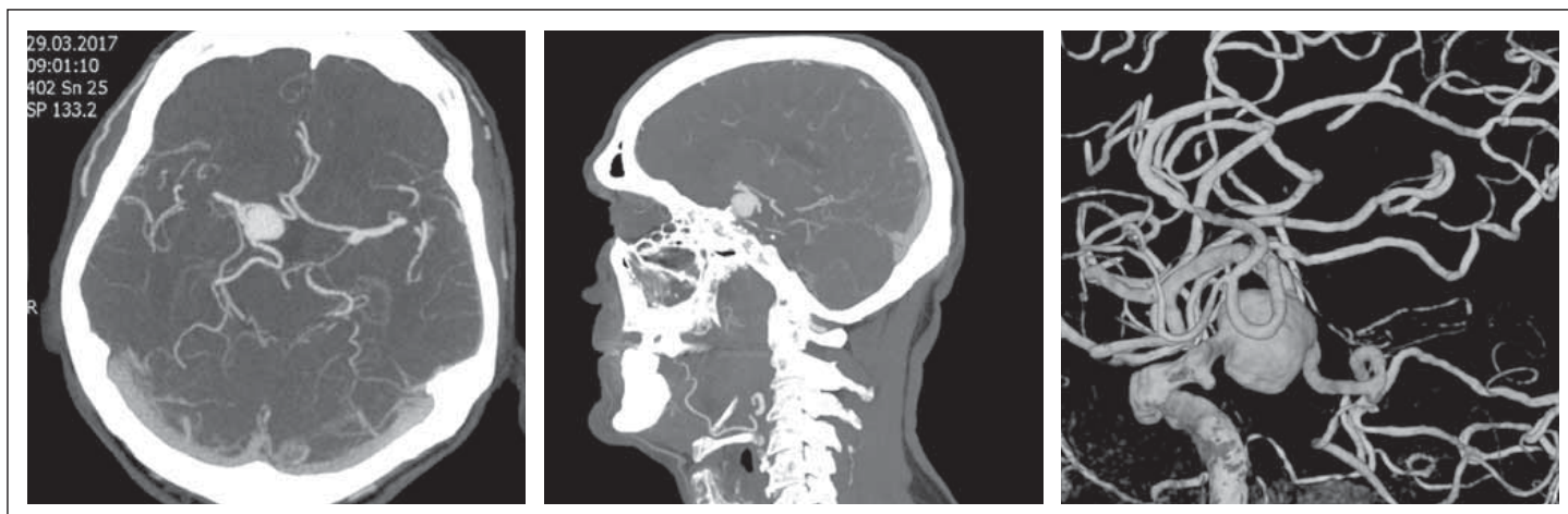
Fig. 1. Preoperative CTA and DSA. Complex ventral carotid wall aneurysm (11 × 15 × 14 mm) on the right 2 mm distal to the origin of the ophthalmic artery and involving the posterior communicating segment of the internal carotid artery with a fetal-type posterior communicating artery arising from the aneurysm sac. The anterior choroidal artery was distal to the aneurysm.

Obr. 1. Předoperační CTA a DSA. Komplexní aneuryzma ventrální stěny karotidy (11 × 15 × 14 mm) umístěné vpravo 2 mm distálně od odstupu arteria ophthalmica a zahrnující zadní komunikující segment arteria carotis interna a arteria communicans posterior fetálního typu, odstupující přímo z vaku aneuryzmatu. Arteria chorioidea anterior odstupuje distálně od výdutě.