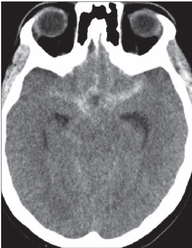
Fig. 1a. Subarachnoid hemorrhage in the basal cisterns in a non-contrast CT scan of the brain.

Obr. 1a. Subarachnoidální krvácení v bazálních cisternách na nativní CT mozku.