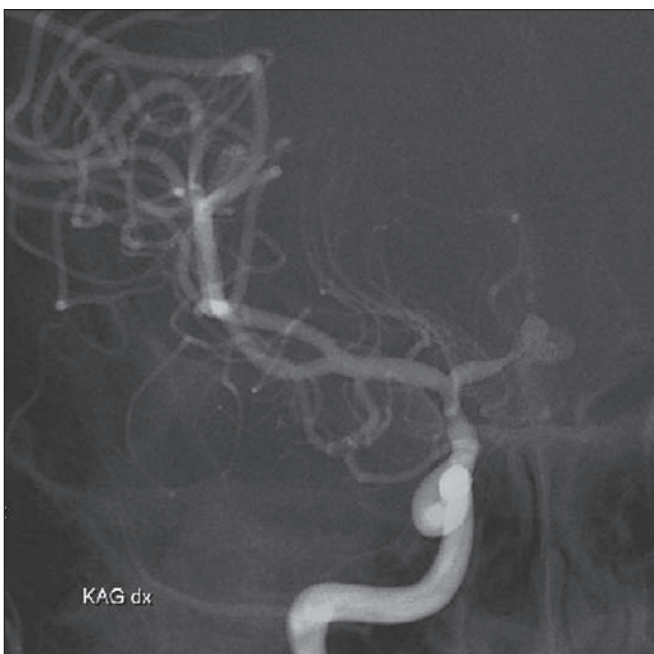
Fig. 2a. Recanalisation of the aneurysm in angiography. A bilocular aneurysm with coils pressed against the top of the fundus.

Obr. 1c. Úspěšná embolizace aneuryzmatu.