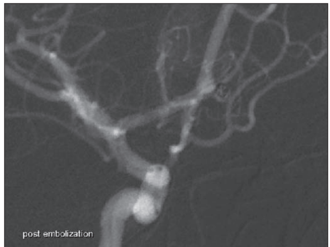
Fig. 1c. Successful embolisation of the aneurysm.

Obr. 1b. DSA – dopředu mířící aneuryzma přední komunikující tepny.