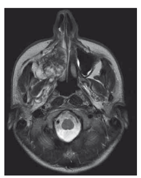
Fig. 2. MRI transverse view – sarcoma in the right maxilla, obstructing right part of nose, deviating nasal septum and expanding into infratemporal fossa.

A 32-year-old woman was referred to the Department of Oral and Maxillofacial Surgery, University Hospital Brno, for gradually enlarg-