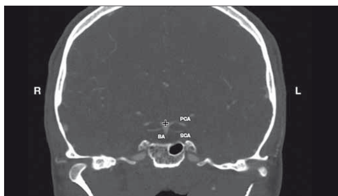
Fig. 1. Determination of the BAB. Coronal reconstruction of CTA of the head.

The distance between the BAB and the sagittal midline plane (MP) as well as the transverse plane (TP) selected at the lowest DS point was determined using the bone window (W = 1500, L = 300)