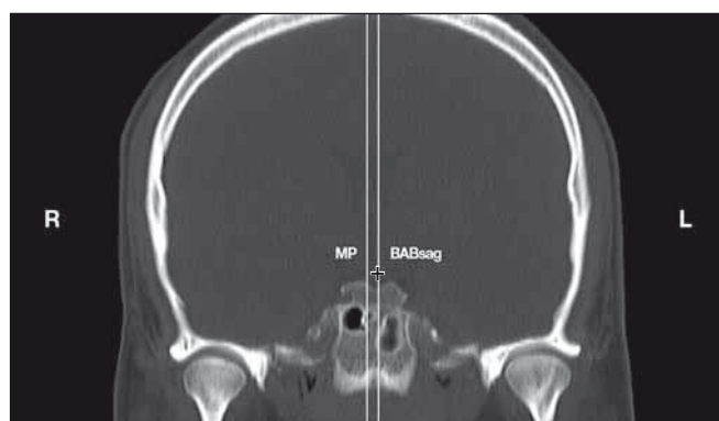
Fig. 2. Position of the BAB in relation to the MP. Coronal reconstruction of CTA of the head.

BA – bazilární arterie; BAB – bifurkace bazilární arterie; L – vlevo; PCA – arteria cerebri posterior; R – vpravo; SCA – arteria cerebelli superior + označení