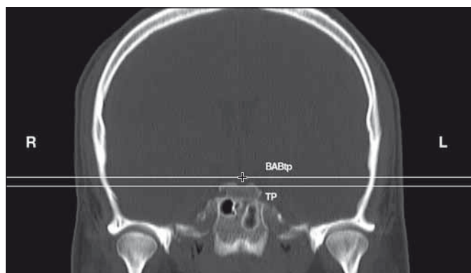
Fig. 3. Position of the BAB in relation to the TP. Coronal reconstruction of CTA of the head.

BAB – basilar artery bifurcation; BABtp – transverse BAB plane; L – left; R – right; TP – transverse plane; TP-BABtp – distance between the TP and BABtp expressed in mm + a marker