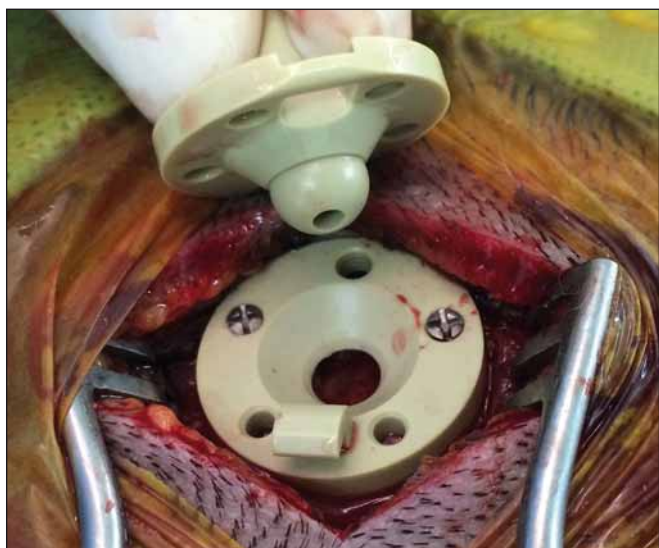
Fig. 1. The adaptor used to fix the guiding stylet during frameless biopsy.

Another limitation of frameless biopsy is that the tilt angle of the catheter from the entry point to the target is narrow. In a frame-based biopsy, there is no limitation on the tilt angle of the catheter, such that the possible entry point area is wide. In our institution, we used a fixing adaptor (Stryker Corporation, Kalamazoo, USA) for the guiding stylet that consisted of a fixed part and a movable part