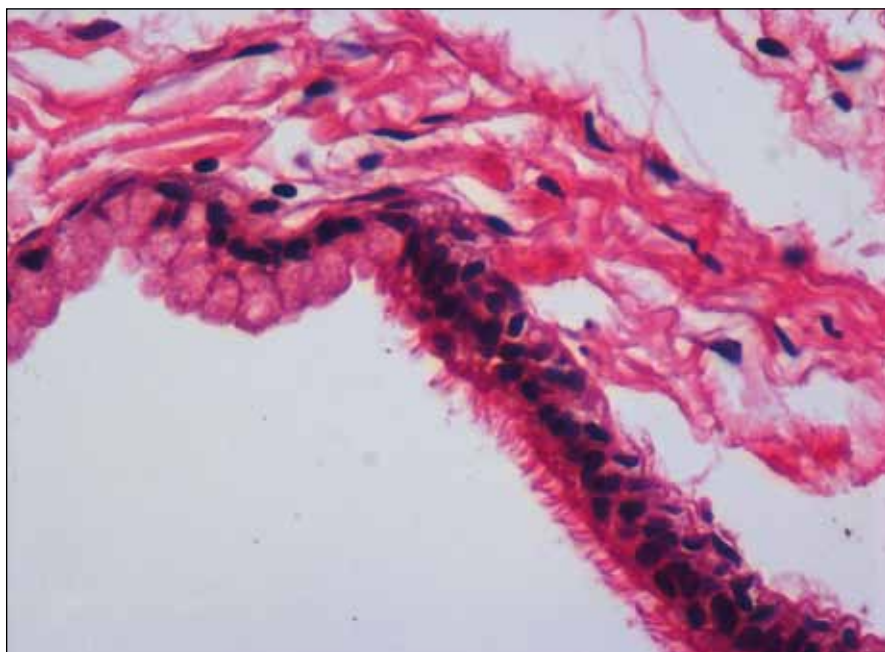
Fig. 2. Epithelial lining of the cyst wall: intestinal-enterogenous epithelium with goblet cells suddenly replaced with columnar ciliated respiratory epithelium. Hematoxylin-eosin staining, original magnification 60x.

during the second or third decade of life. Review of cases shows an average patient age of approximately 28 years (Tab. 1) [1–5]. The characteristic symptoms of a NEC in the CCJ include headache, mainly occipital, nuchal spasms