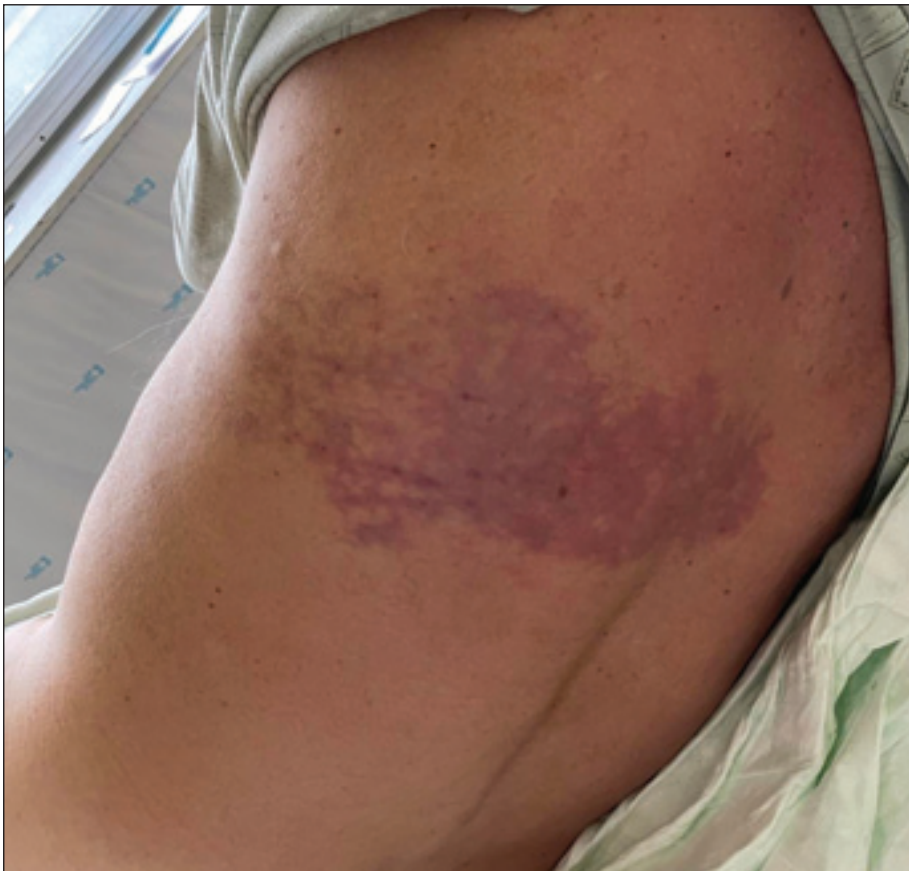
Fig. 1. Skin changes in dermatomes T8-9 on the left side of the back mimicking infectious etiology.

Obr. 1. Kožní změny v dermatomech T8-9 na levé straně zad napodobující infekční etiologii.