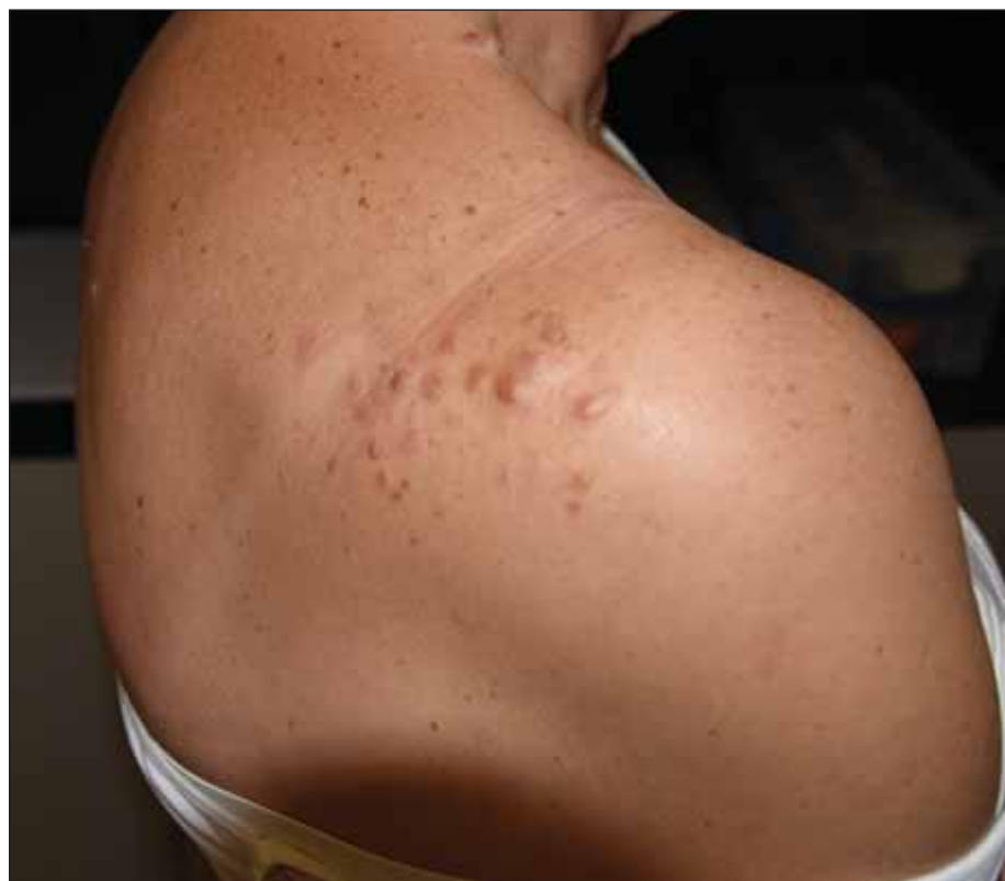
Fig. 1. Multiple shoulder neurofibromas.