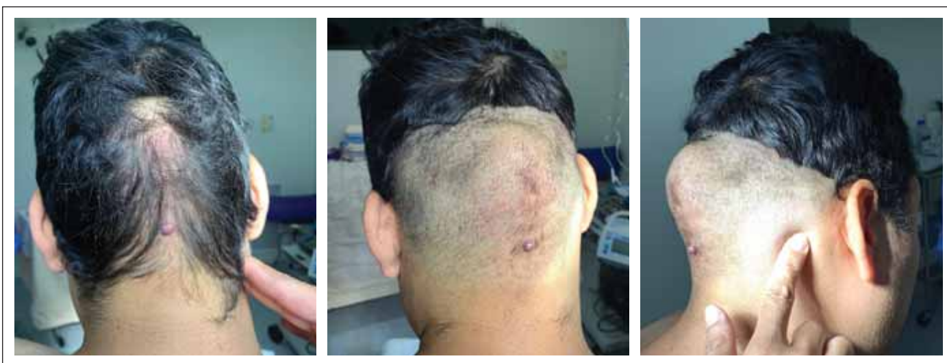
Fig. 1. Photographs prior to surgery.