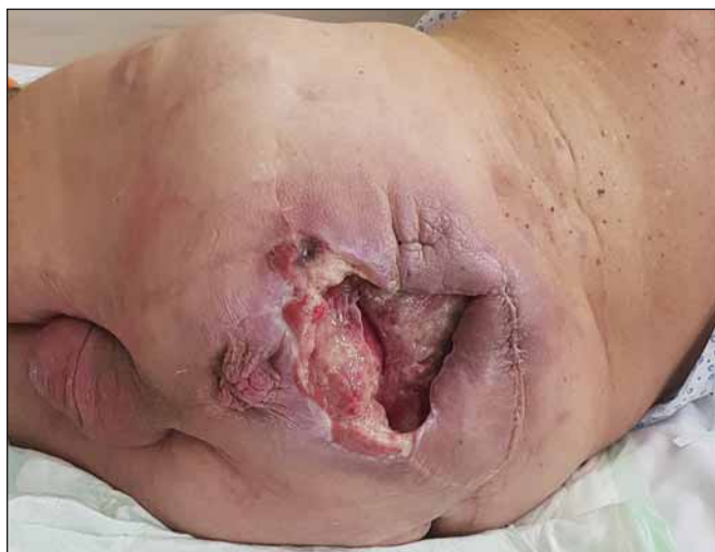
Fig. 1. Large and deep pressure ulcer in whole sacral region.

Obr. 1. Rozsáhlý dekubitus postihující prakticky celou oblast sakra a hýždí.