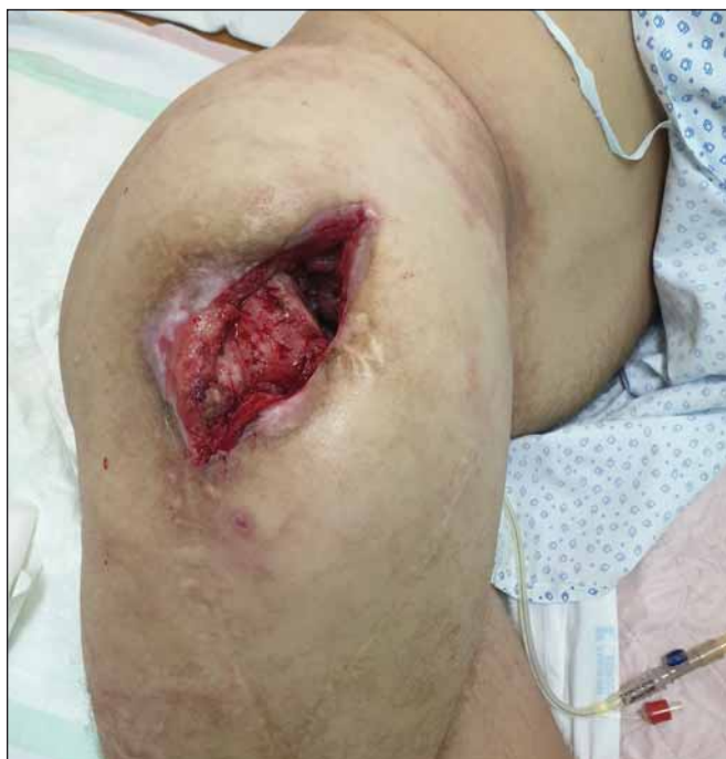
Fig. 3. Large trochanteric defect with luxated femur. Picture after osteotomy of proximal femur, including caput femoris.

Obr. 3. Rozsáhlý trochanterický dekubitus s dominující luxovanou kyčlí. Obrázek již po provedené osteotomii hlavy a proximální části femuru.