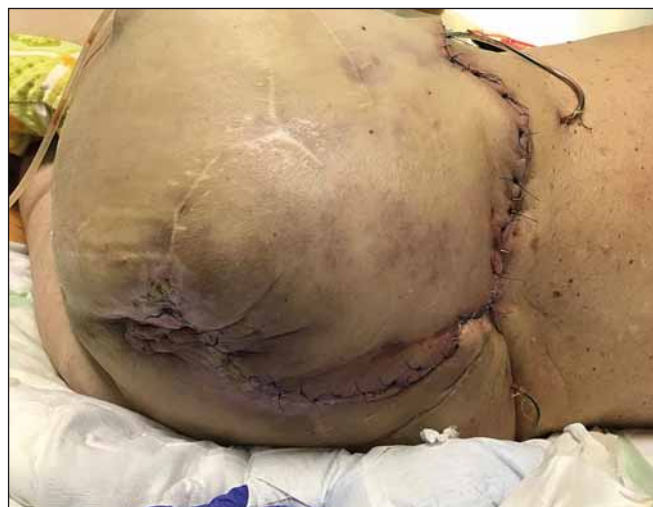
Fig. 2. Defect after closure with large transposition flap.

Obr. 1. Rozsáhlý dekubitus postihující prakticky celou oblast sakra a hýždí.