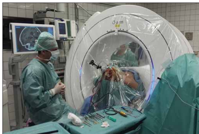
Fig. 1. Intraoperative picture of navigated O-arm system. Obr. 1. Peroperační foto navigovaného systému O-arm.

To perform MER in STN-DBS, four MER/macrostimulation needles were placed in an array