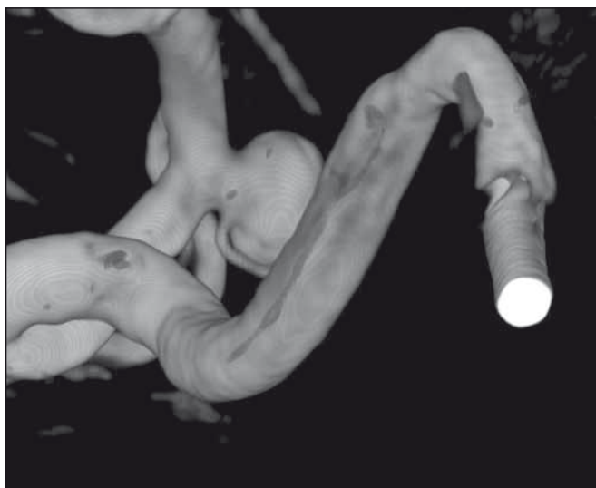
Fig. 1. Angiography 3D reconstructions showing anterior choroidal artery arising from the aneurysm neck.

Obr. 1. 3D rekonstrukce angiografie zobrazující arteria choroidea anterior vystupující z krčku aneurysmatu.