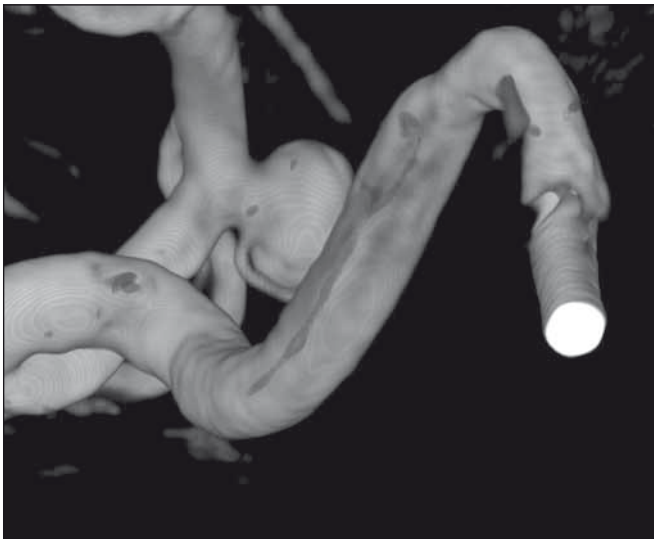
Fig. 1. Angiography 3D reconstructions showing anterior choroidal artery arising from the aneurysm neck.

Obr. 1. 3D rekonstrukce angiografie zobrazující arteria choroidea anterior vystupující z krčku aneurysmatu.