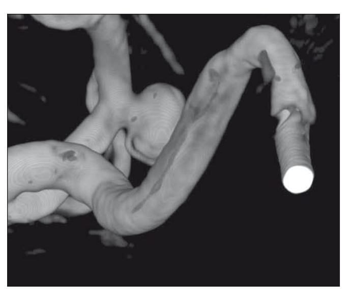
Fig. 1. Angiography 3D reconstructions showing anterior choroidal artery arising from the aneurysm neck.

Obr. 1. 3D rekonstrukce angiografie zobrazující arteria choroidea anterior vystupující z krčku aneurysmatu.