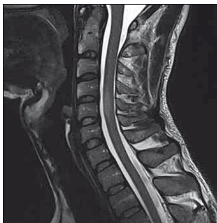
Fig. 2. MRI of the cervical spine.

A T2 hyperintense demyelinating lesion in the left occipitally lobe.