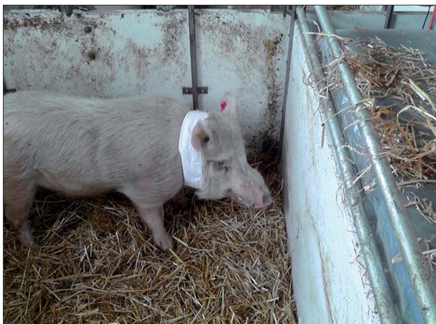
Fig. 1. The positioning of the collar for activity measurement in TgHD boar.

Moreover if the measurement was not running, minipigs still wore the empty collars. It eliminates the collar influence on their behavior. Minipig boars wore a collar with