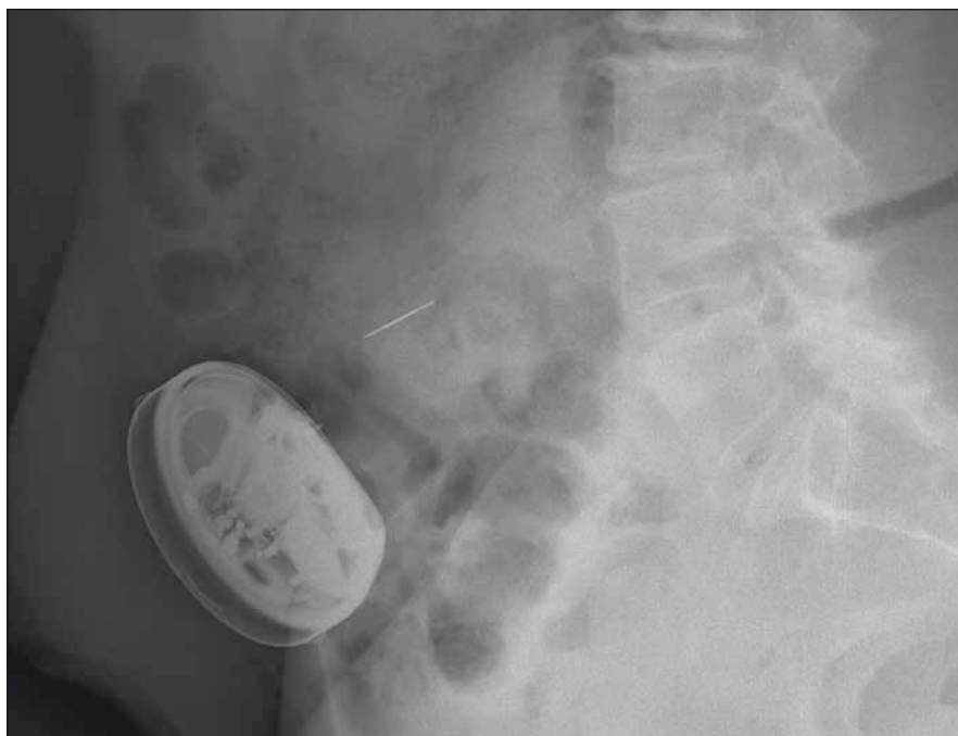
Fig. 2. Pump rotation in downright position.