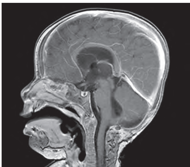
Fig. 3. Postoperative sagittal MRI section.

only congenital but also iatrogenic (e.g. due to lumbar puncture performed with an open needle) or traumatic (e.g. due to a stab or puncture wound), occurring as a consequence of an implantation of skin elements from the surface into underlying tissues. This type of a cyst may occur at any age but much less commonly than the congenital one [6]. At present, CT and MRI scans are both used for the diagnosis of this tumour. CT images the dermoid cyst as a hypodense lesion, not enhancing after a contrast agent administration, unlike abscesses that, if present, are more dense and their capsule is markedly enhanced by a contrast agent. CT bone window is used for bone defects detection. Defects not diagnosed with CT (axial slices may miss it) can be identified with MRI, especially with sagittal plane sections that show the typically oblique stalk that links the cyst with the skin [7]. Dermoid cysts tend to show an increased signal intensity on both T1 and T2-weighted MRI images and a low signal intensity on STIR images [8], although a ruptured cyst may be hypointense on T1-weighted images and hyperintense on T2 [8]. Posterior fossa dermoid cysts may be divided into four types: extradural dermoid cysts with a complete dermal sinus, intradural dermoid cysts without a dermal sinus, intradural dermoid cysts with an incomplete dermal sinus and, as in our case, intradural dermoid cyst with a complete dermal sinus [3]. Intradural dermoid cysts with a complete dermal sinus are difficult