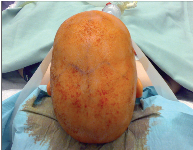
Fig. 1. Preoperative state in patient with dolichocephaly in four months.